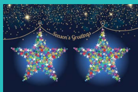
Twinkling Stars ST665, Gold Foil