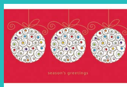
Colourful Baubles BA685, Gold Foil