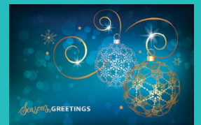
Stunning Baubles BA676, Gold Foil