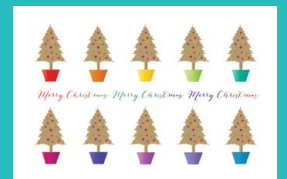
P petite Trees TR633, Gold Foil