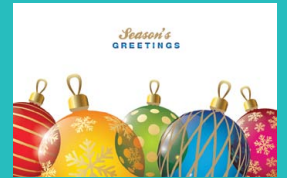
Sparkling Baubles BA663, Gold Foil