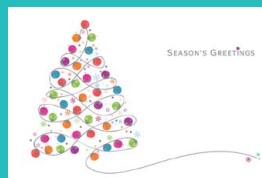
Swirling Tree TR662, Silver Foil