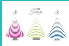
Trendy Trees TR621, Silver Foil