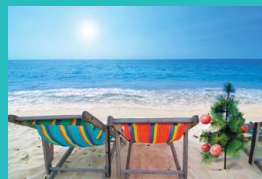
Christmas Holidays FE666