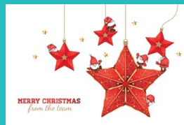
Santa's Wishes FE523, Gold Foil