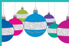
Glowing Baubles BA648, Silver Foil