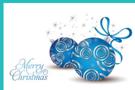
Moonlight Baubles BA694, Silver Foil