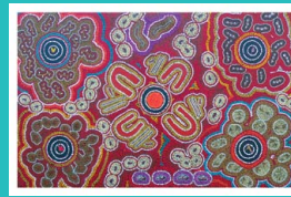
Dreamers by the Fireside AU622