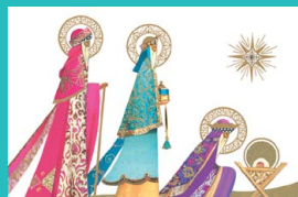
Magnificent Kings RE687, Gold Foil