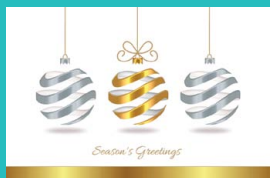
Stylish Baubles BA561, Gold Foil