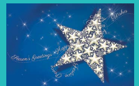
Shooting Star ST515, Silver Foil