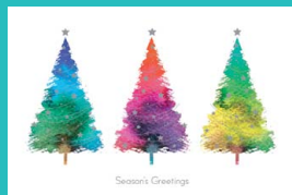
Watercolour Trees TR437, Silver Foil