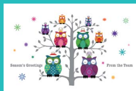
Christmas Hoot FE598, Silver Foil