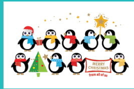
Cheeky Team FE617, Gold Foil