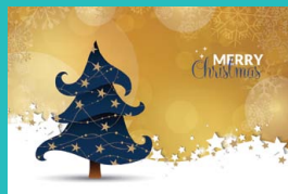
Dancing Tree TR654, Gold Foil