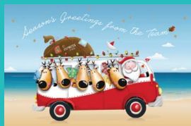
Quirky Team FE500, Gold Foil