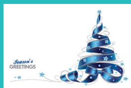
Gorgeous Tree TR555, Silver Foil