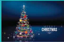
Vibrant Tree TR544, Silver Foil

All our Christmas Cards mailed during November and December will only need a 65c stamp!