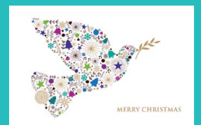
Magical Dove DO557, Gold Foil