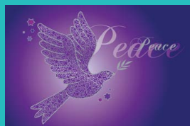
Dove of Peace DO690, Silver Foil